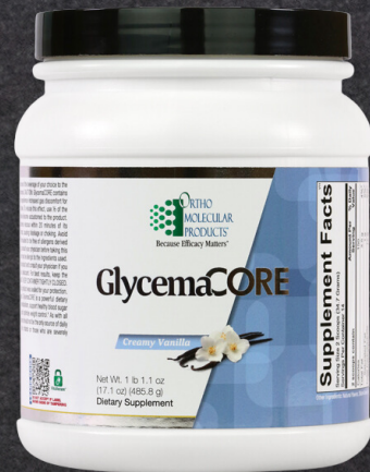
Reduce Night Time Cravings