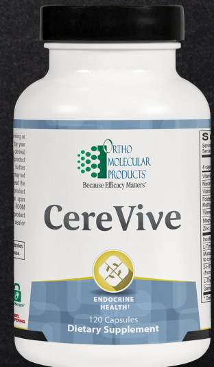
Supports Dopamine Production