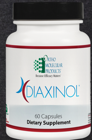
Blood Sugar Support