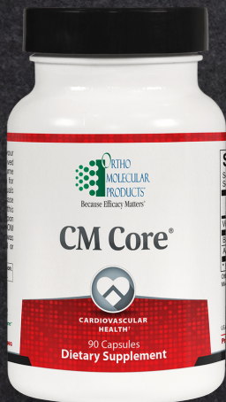
Berberine + Lipoic Acid Activates AMPK