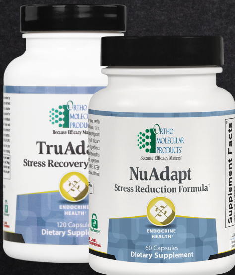
Stress Management TruAdapt - Stressed & Tired NuAdapt - Stressed & Wired