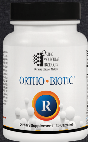
Balances Gut Microbiota